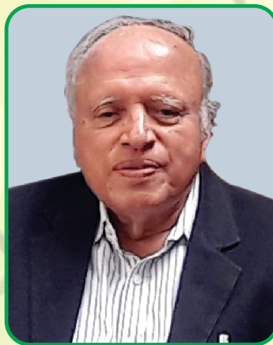
Padma Vibhushan Prof. M.S. Swaminathan Founder Chairman and Chief Mentor, M.S. Swaminathan Research Foundation (MSSRF), Chennai & UNESCO Chair in Ecotechnology